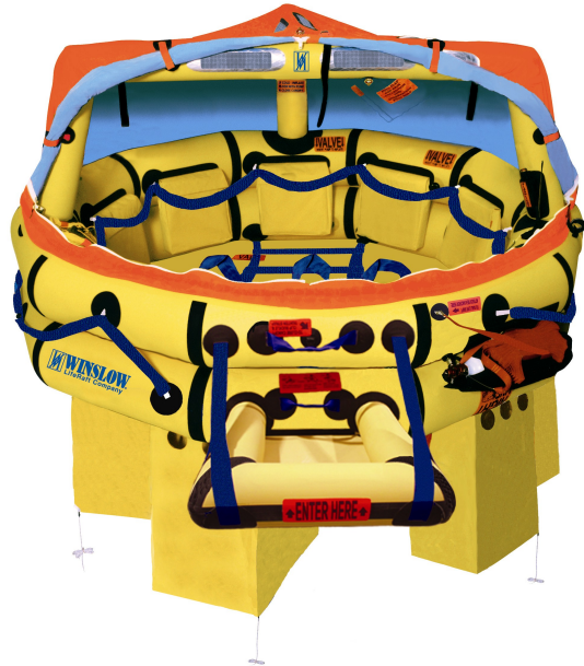
→ Front View Closed Canopy w/ Clear, Fixed View Ports