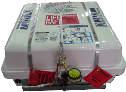
Low Profile Traditional Marine Canister, UV Inhibiting With Cradle & Hydrostatic Release As Shown Above: 25" x 25.5" x 14½" Without Cradle: 25" x 25.5" x 12 ½" With Cradle: 25" x 25.5" x 14 ½"