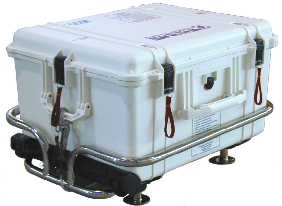
WINSLOW Pelican® Pac 4 or 6 Person Offshore With Cradle As Shown Above: 25" x 20 ½" x 16 ¼" Without Cradle: 25" x 20" x 14"